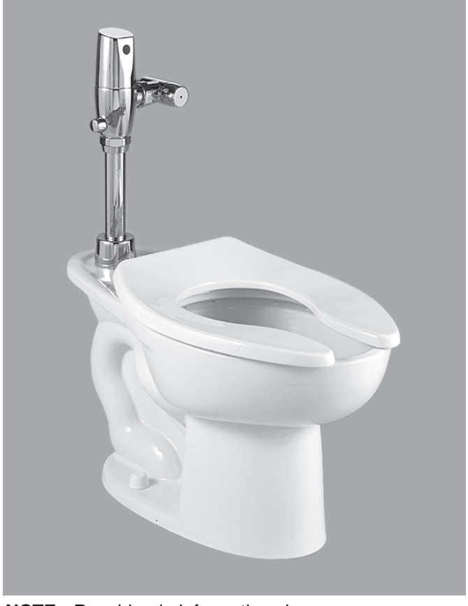
NOTE: Roughing-in information shown on reverse side of page